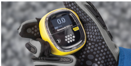
Easy to handle