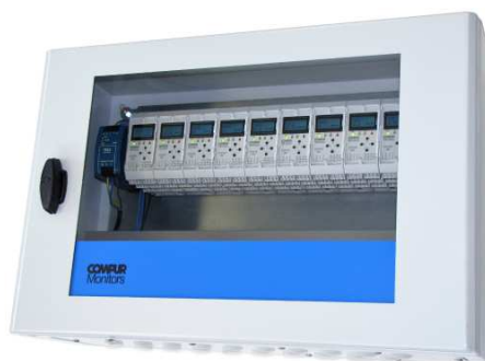
Statox 502/503 Cabinet for 9 Control Modules