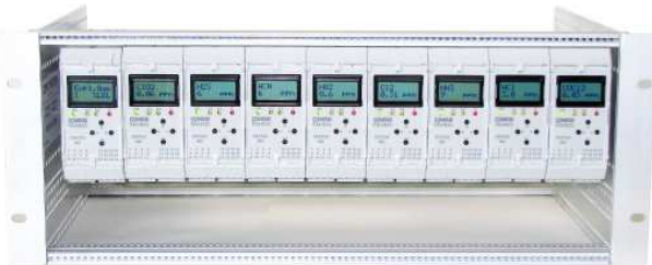
Stattox 502/503 19" Rack